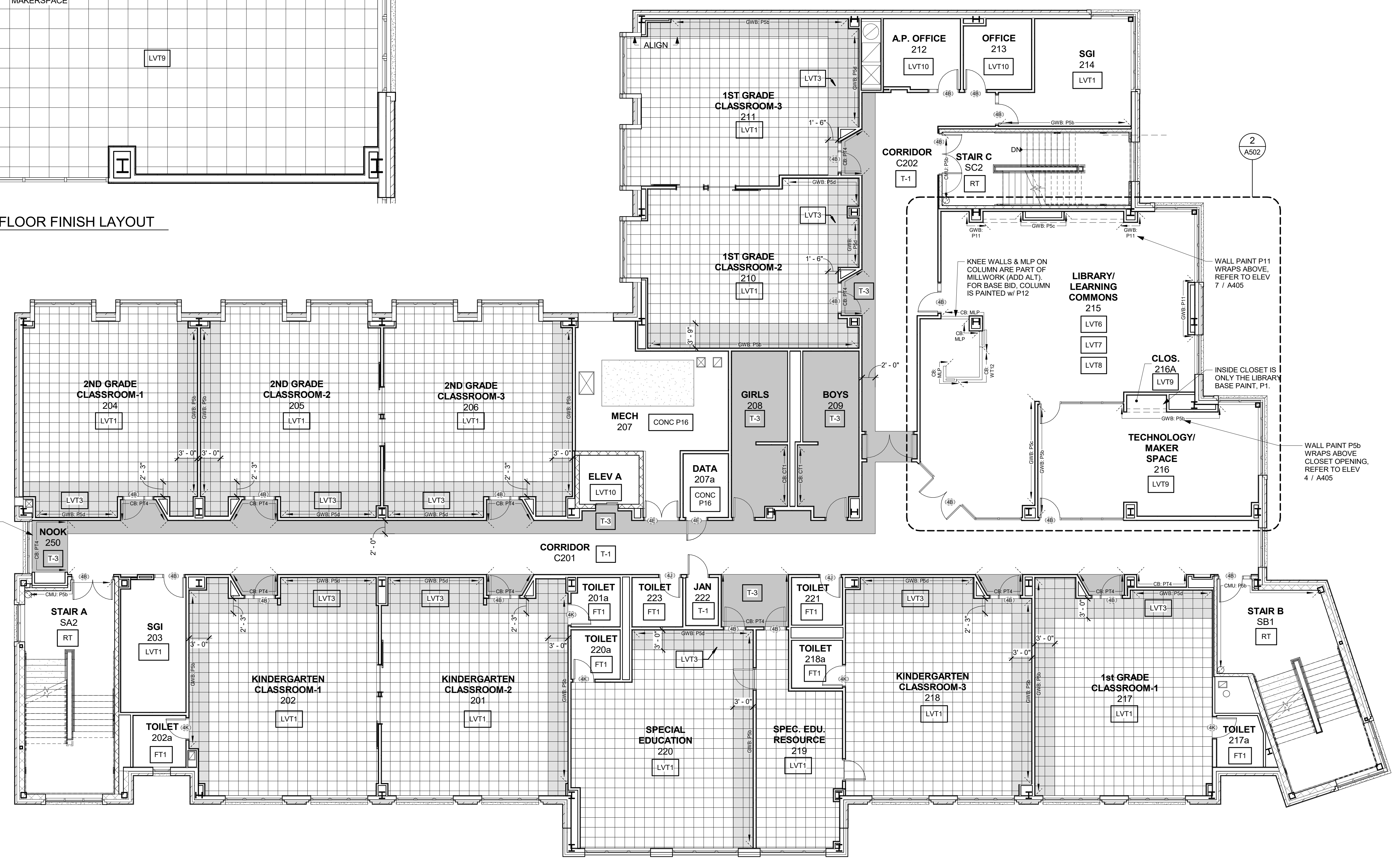
1 2nd FLOOR FINISH PLAN 1/8" = 1'-0"

JUST WITHIN THE NOOK FLOORS ARE T-3, WALLS ARE PT4, AND CLNG IS P4B.