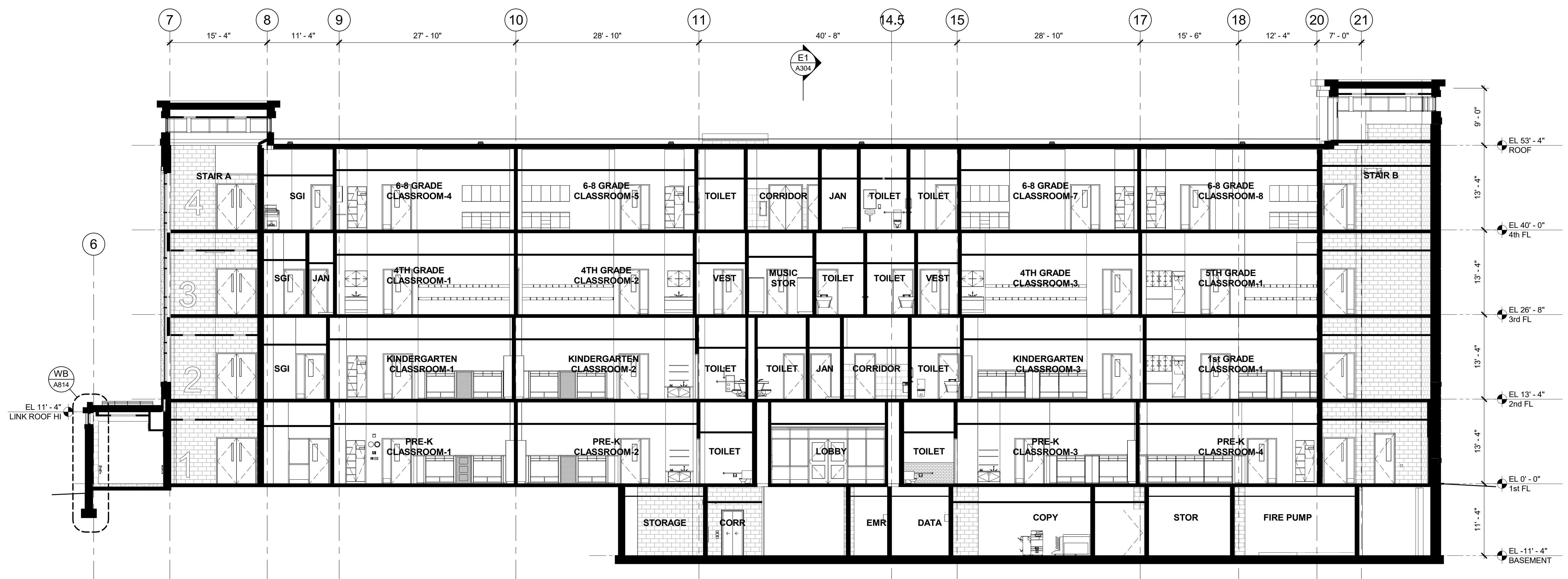
N1 BUILDING SECTION N1 - LOOKING NORTH1 1/8" = 1'-0"